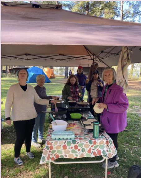
Dallas Town Brunch