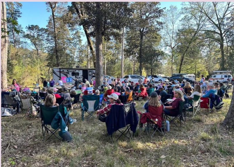
Appetizer Meet and Greet