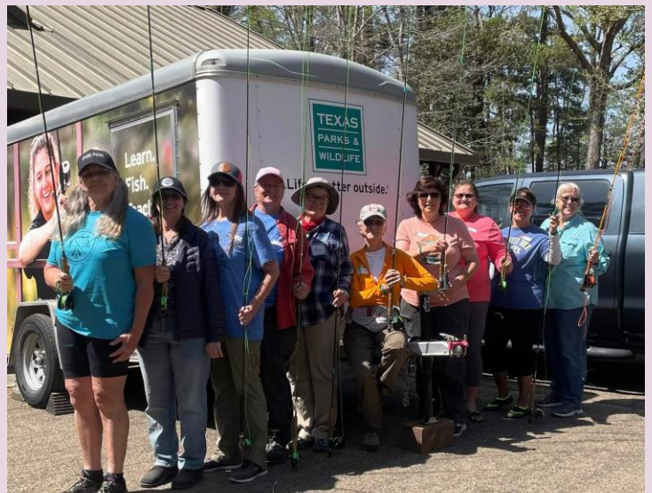
Fly Fishing Class