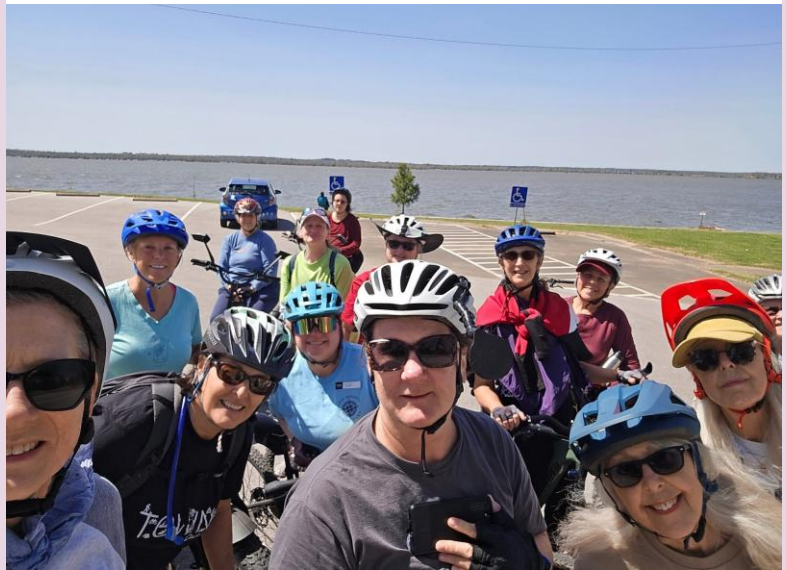
Townies go for a bike ride