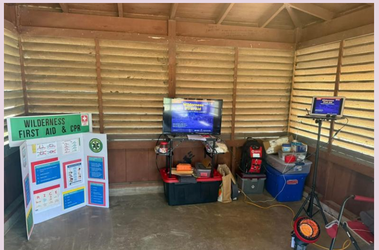
Wilderness First Aid