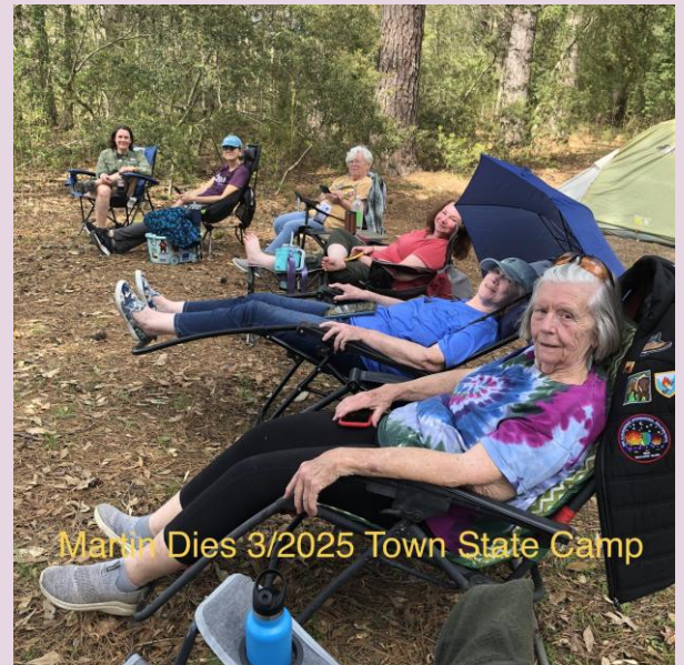
Marlin Dies 3/2025 Town State Camp