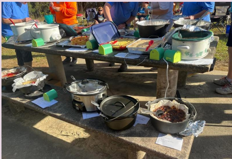
Dump Cake Contest