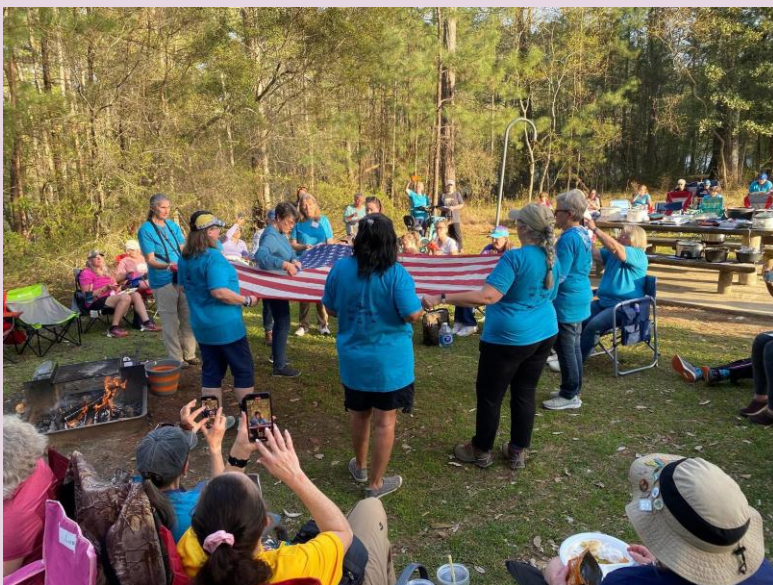
Flag Retirement Ceremony