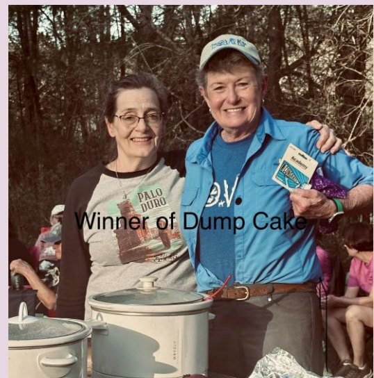
Winner of Dump Cake