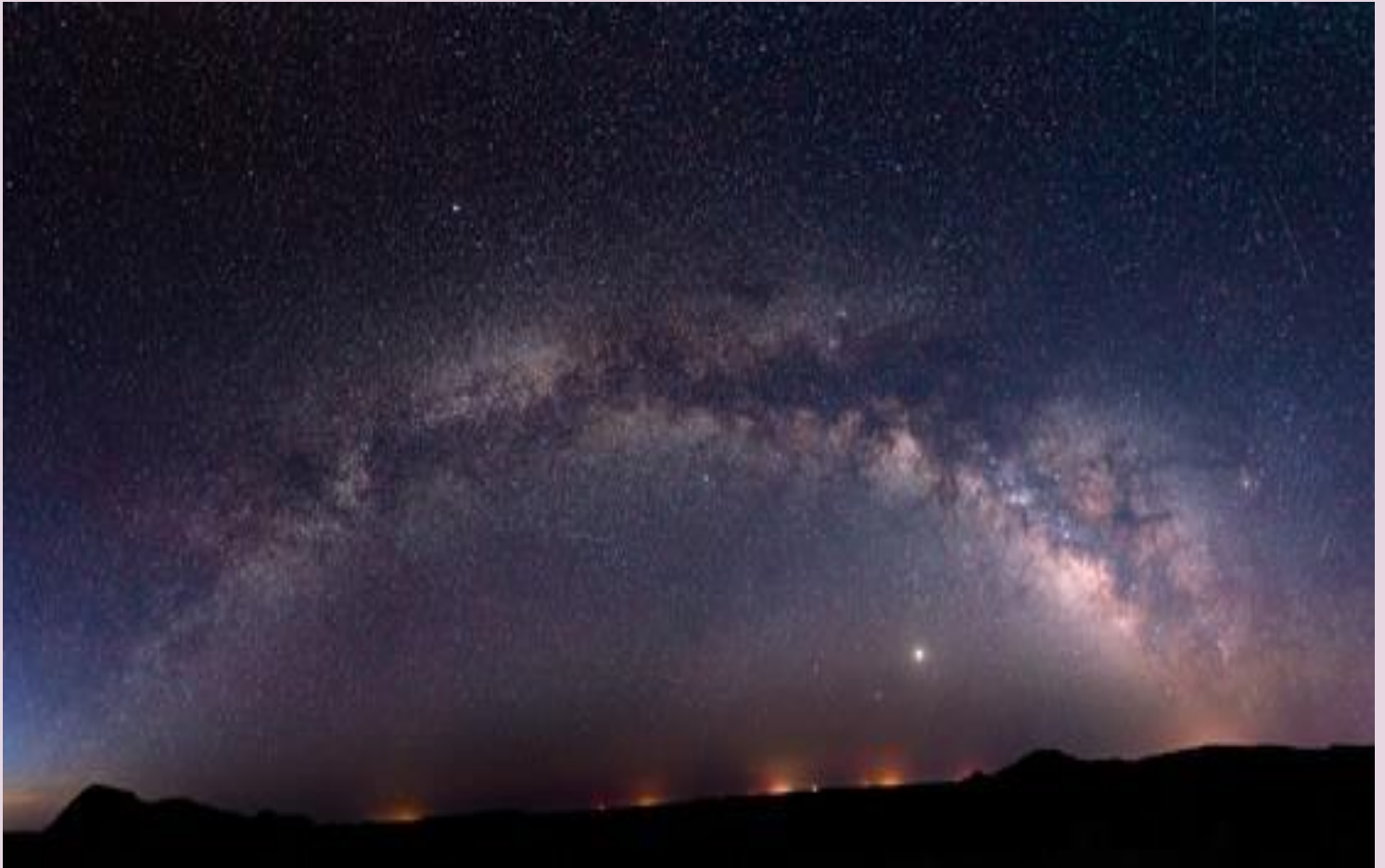
Night Sky at Caprock Canyon