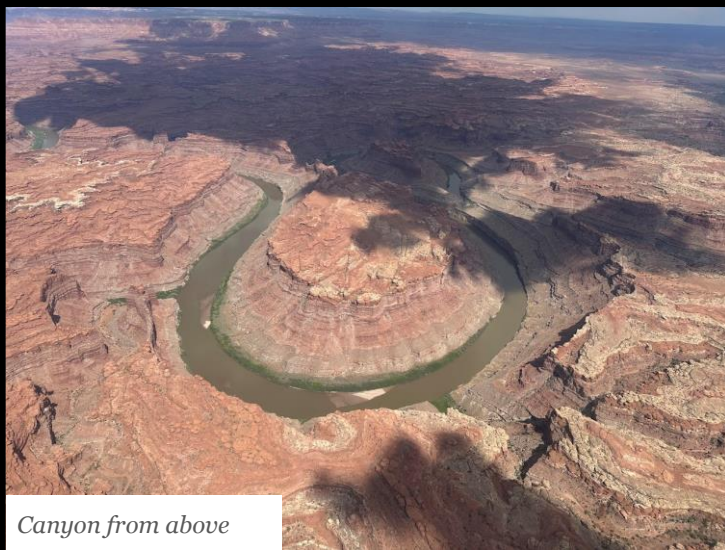
Canyon from above

Rafting was spectacular, filled with warm days (106 on two) but cooler comfortable nights. Water temp allowed for frequent swimming stops with an opportunity to play in the rapids. Our guides couldn't have been nicer showing off their culinary expertise with grilled steak, Asian chicken salad, and a creamy pesto tortellini. Our only mishap was an unexpected storm Saturday night that left everyone scrambling to their tents to support the poles and prevent them from snapping. But after about 45 minutes of chaos the clouds parted, the stars came out and sleeping under the stars was back. Sharon Fahlberg