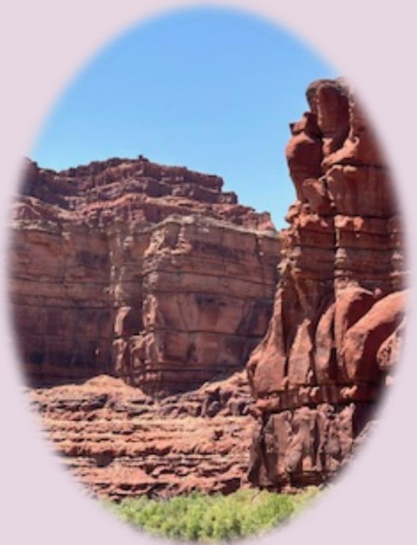
Cateract Canyon Beauty!