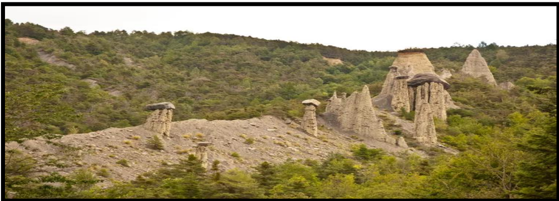
Kasha -Katuwe Tent Rocks- New Mexico