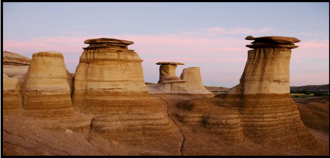
Demoiselles Coiffées - France