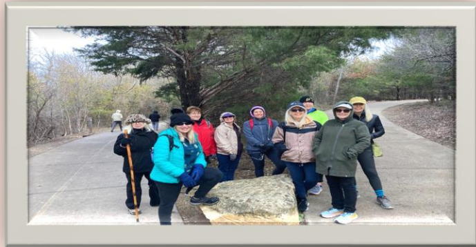
TOWN hikes Arbor Hills