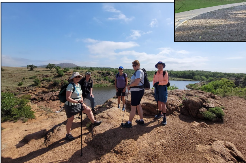
Overlook on the Kite Trail