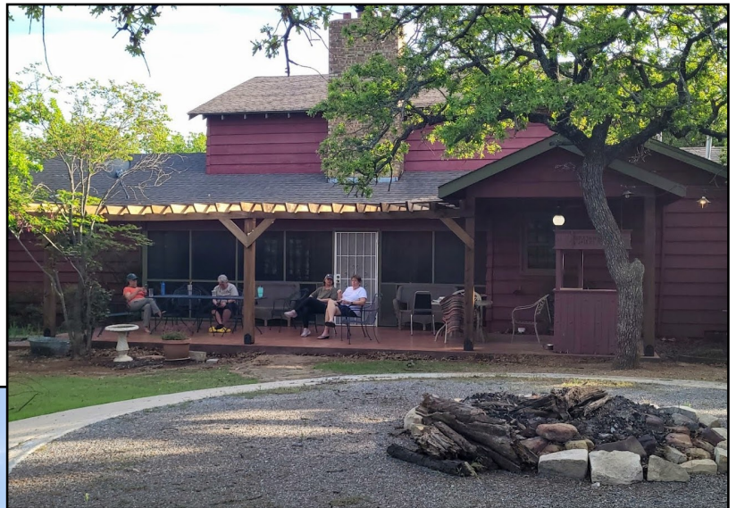
Back patio at the Eagles Landing in Medicine Park