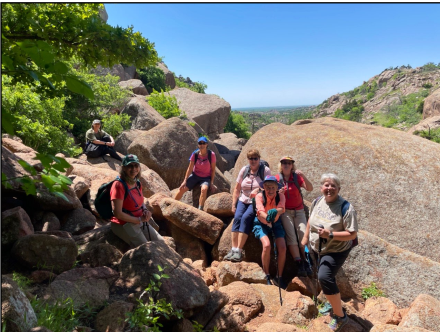
Charon's Garden, Boulder Room