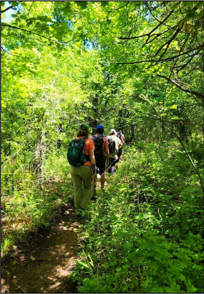
Charon's Garden trail