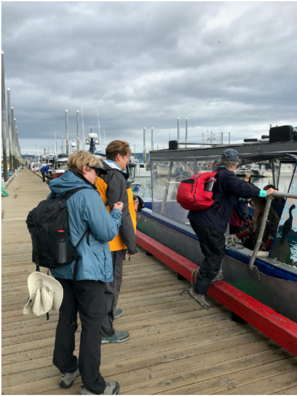
Water taxi from Homer to Right Beach.

Days 10 & 11 we traveled to Anchorage via Homer and the scenic drive along Cook Inlet and then Turnagain Arm. The scenery was spectacular. Our last day in Anchorage before our evening flight we were free to explore the sights.