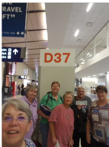
Happy group on their way