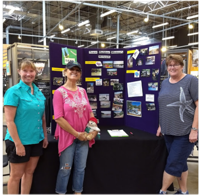
Showing our stuff.