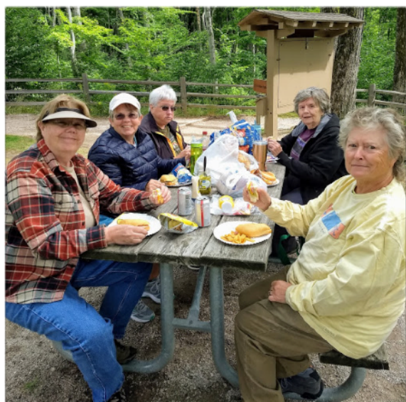
Picnic after hike to Miner's Falls