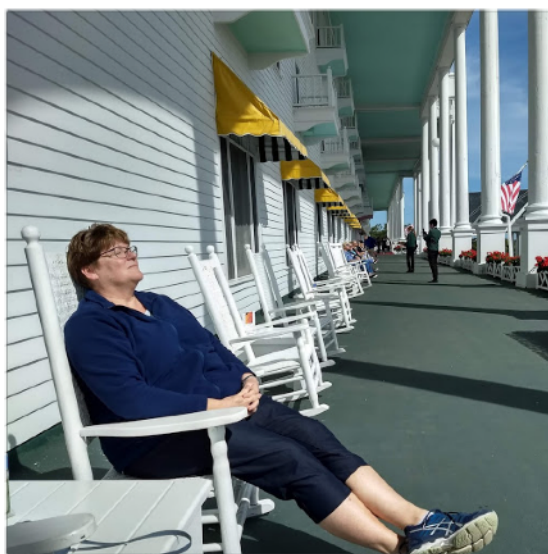
Relaxing on the porch at the Grand Hotel on Mackinaw Island