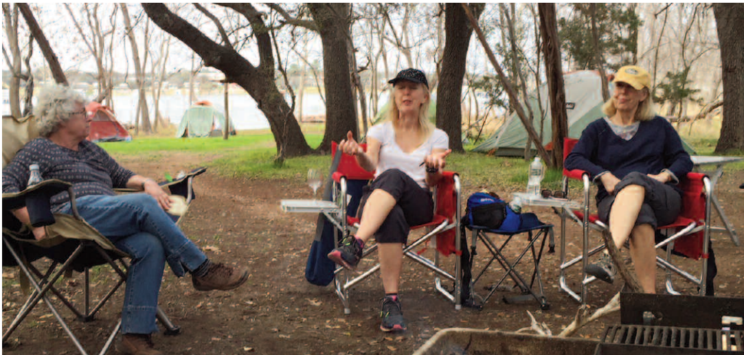
Inks Lake 2016